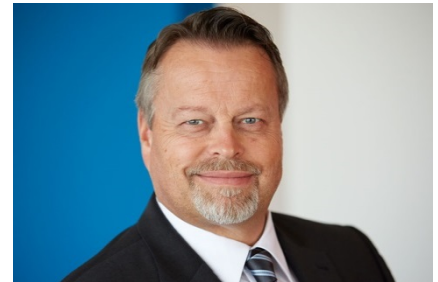
Mr. Kusch - PM Industrial PCs

For such transfer rates at least one PCIe x8 interface of generation 3.0 is required. Therefore, all modern RAID controllers today have a corresponding PCIe x8 interface.